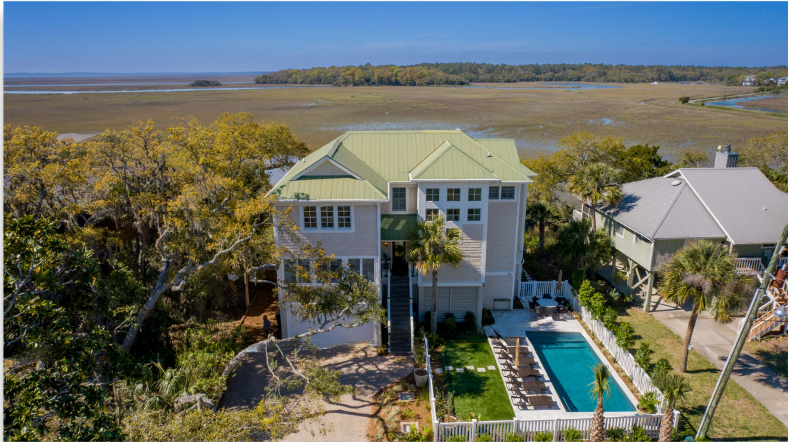
Stunning coastal oasis with breathtaking unobstructed marsh views and sunsets complete with heated pool and beach access.