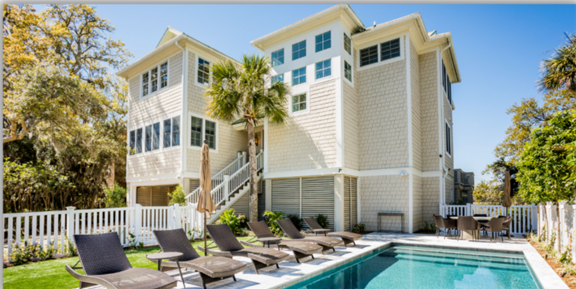
Nestled on Edisto Island, one of SC's hidden Lowcountry Sea Islands; away from the hectic lifestyle and congestion, a true step back in time.